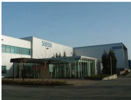
Film production plant (Roermond, Netherlands)

SEKISUI CHEMICAL CO., LTD. (President and Representative Director: Teiji Koge; hereinafter, “SEKISUI CHEMICAL”) has decided to expand European film production with a new film line at its plant in Roermond, and a new resin line at its plant in Geleen, both in the Netherlands. The total cost of this expansion in production capacity is approximately 20 billion yen, with operations set to commence on the new film line in the second half of fiscal 2019, and on the new resin line in the first half of fiscal 2020. With the new film production line, the company mainly plans to produce wedge-shaped interlayer film for head-up displays (HUD), which project information such as speed onto car windshields.