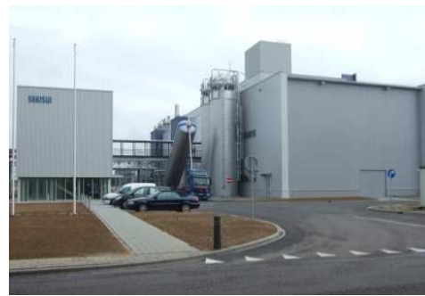
Raw material resin plant (Geleen, Netherlands)